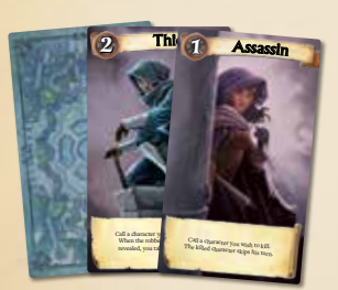
27 CHARACTER CARDS